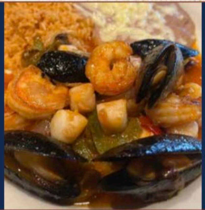
Especial de la Cocina

Chicken, steak and shrimp grilled with bell peppers, onions and mushrooms, then topped with cheese dip. Served on a bed of rice.