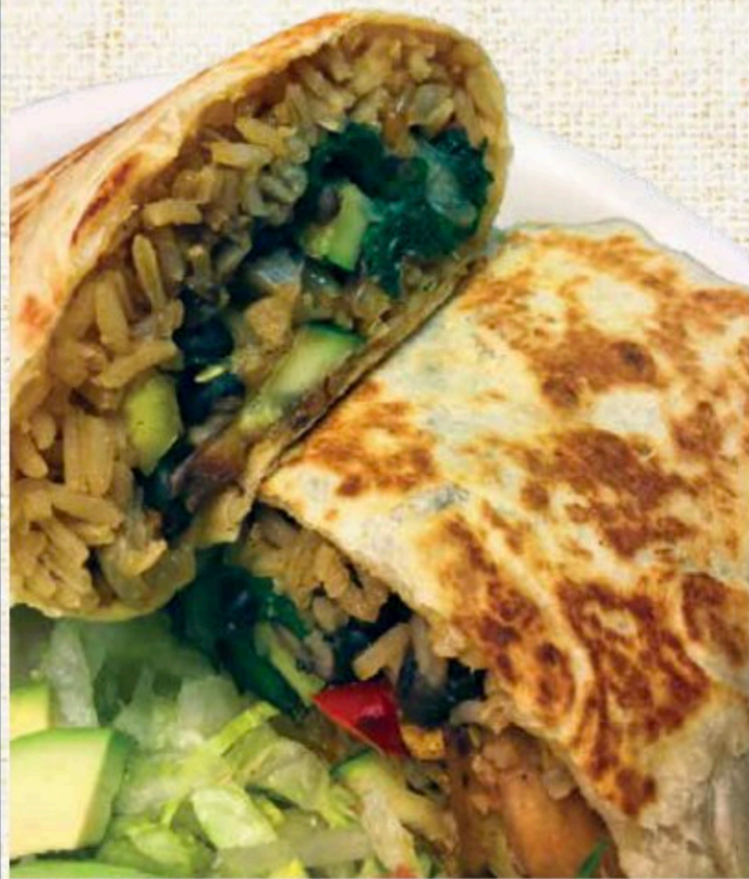
C. Veggie Burrito

Grilled peppers, onions, mushrooms, broccoli, spinach and zucchini. Served over rice topped with cheese sauce.