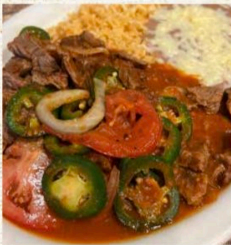
Bistec a la Mexicana